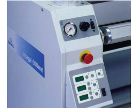
Fully integrated control panel for single location control of speed, pressure, temperature and roller positioning