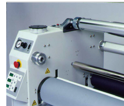
Wide clearance supply shafts for loading large diameter rolls (400ft+)